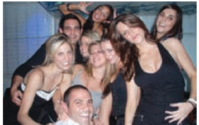
Time out from the dance floor to enjoy the picture opportunity!

We were able to raise an impressive $32,000 for cancer research. The Brett Levien Sarcoma Cancer Foundation will present that money to Cure Cancer Australia to fund a researcher working to bring us one step closer to a cure for cancer.