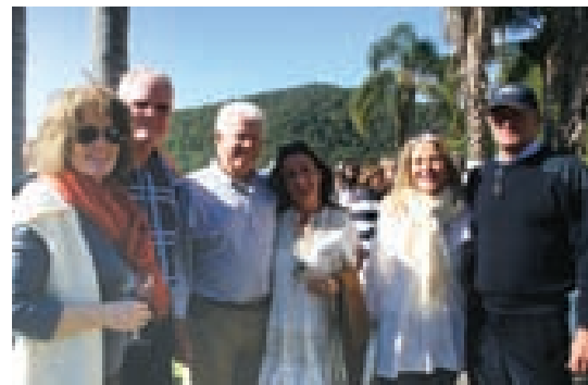
Peats Bite guests sharing a fantastic day and making an outstanding contribution to Cure Cancer